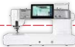
Continental M8 Professional